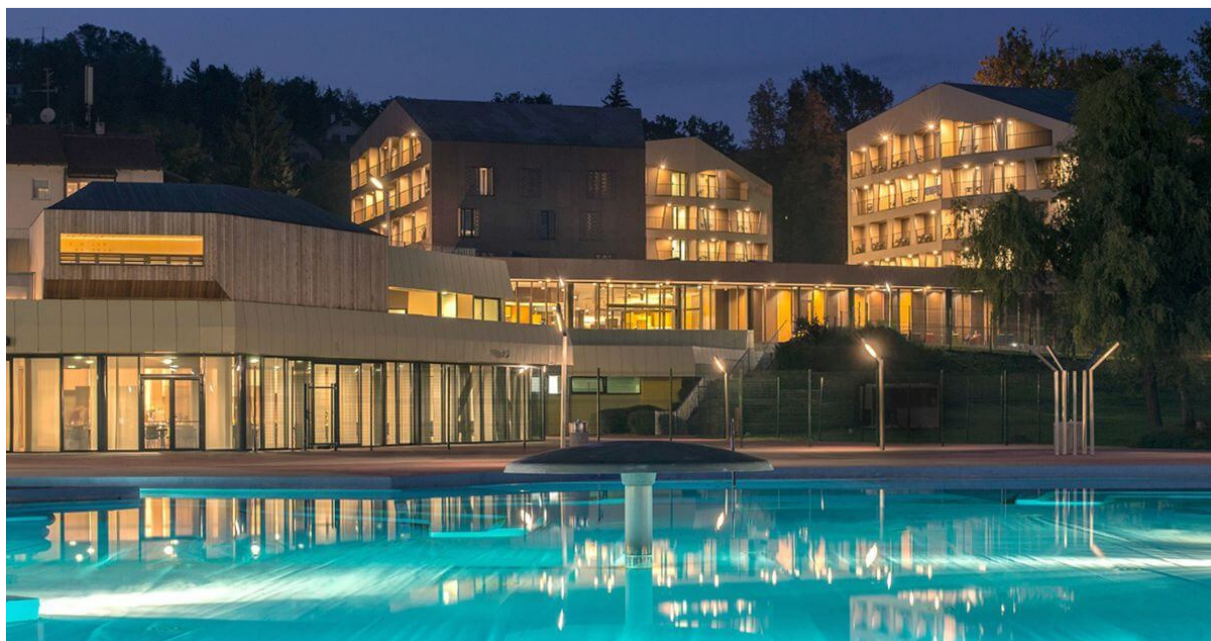
Terme Tuhelj (10 km from flyingsite) http://www.terme-tuhelj.hr/