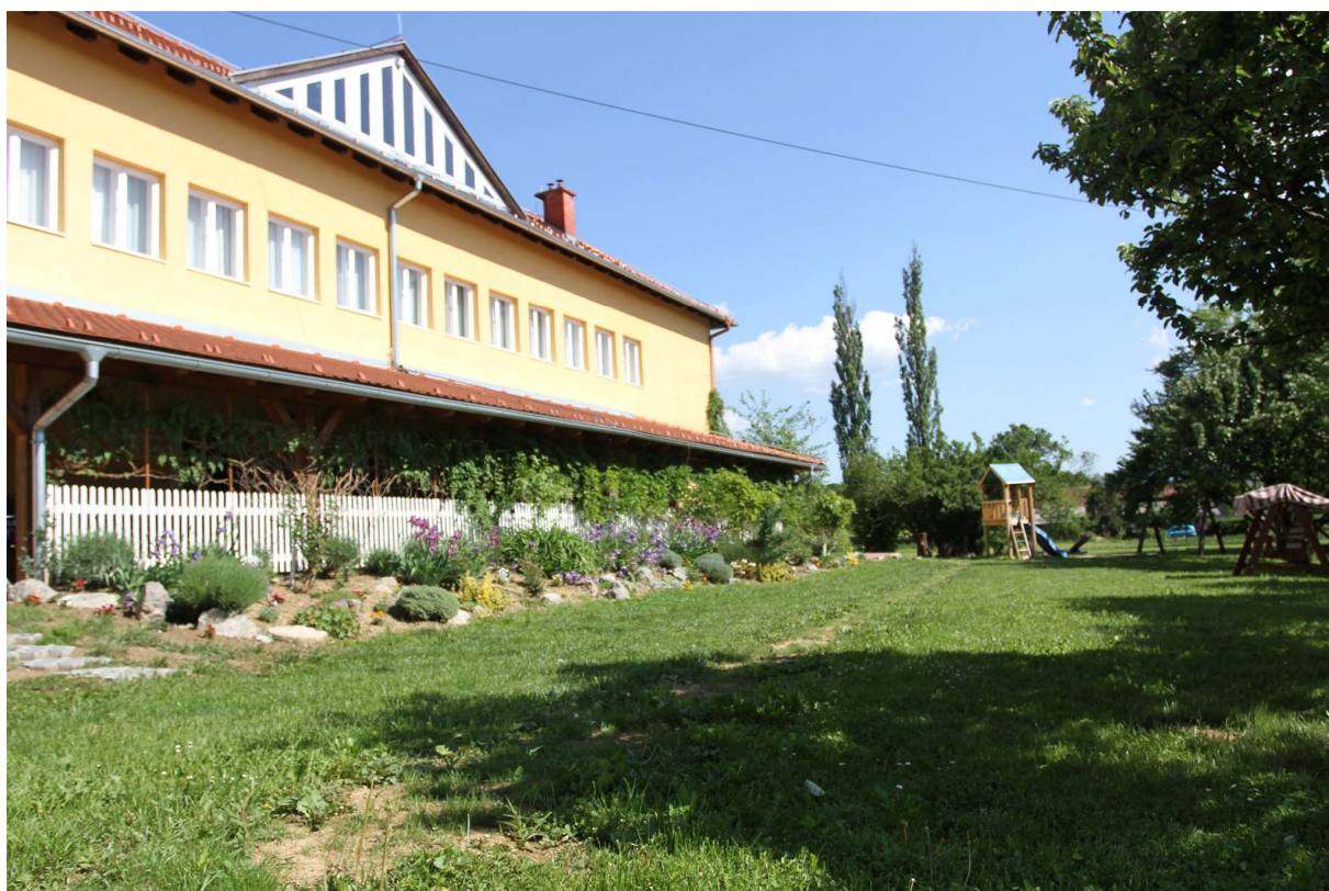
Stara škola (11 km from flying site) http://stara-skola.hr/en/