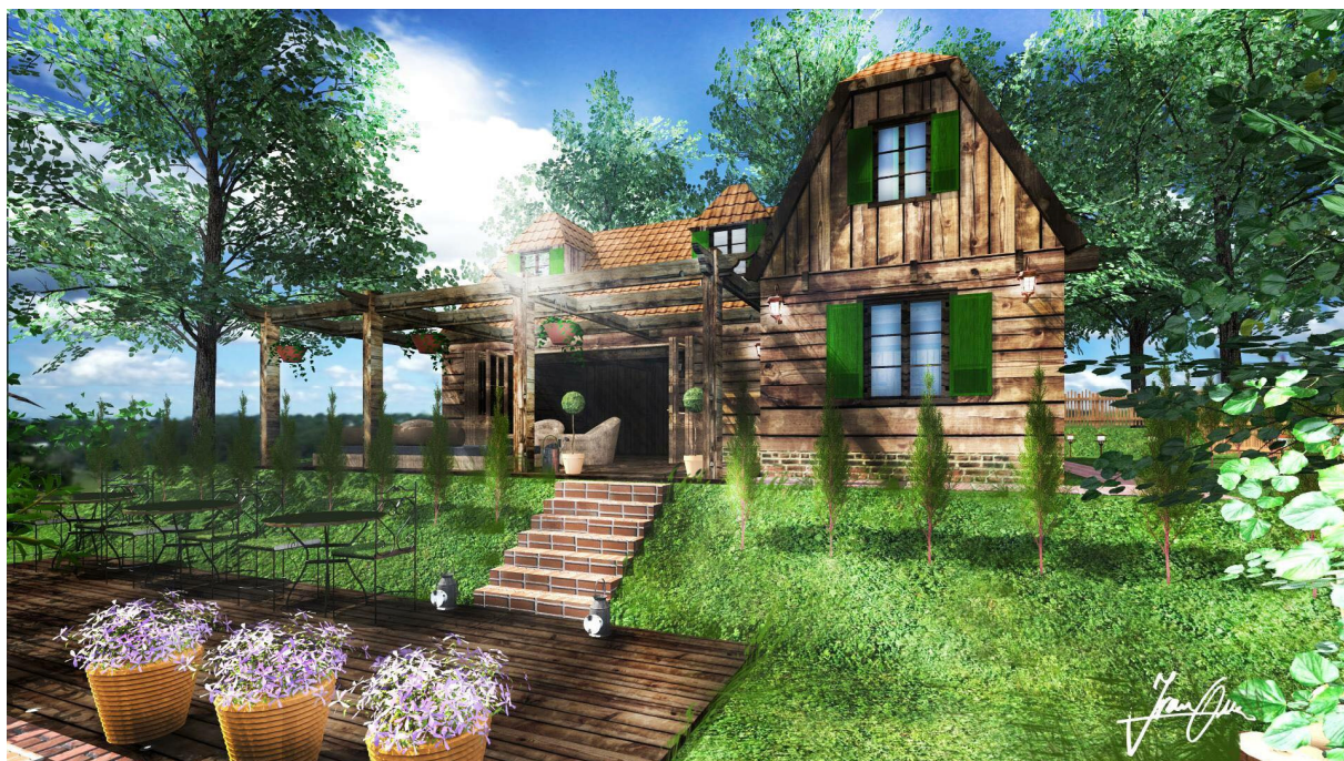
Apartmens Zaboky Village (2 km from flying site) https://zabokyvillage.com/