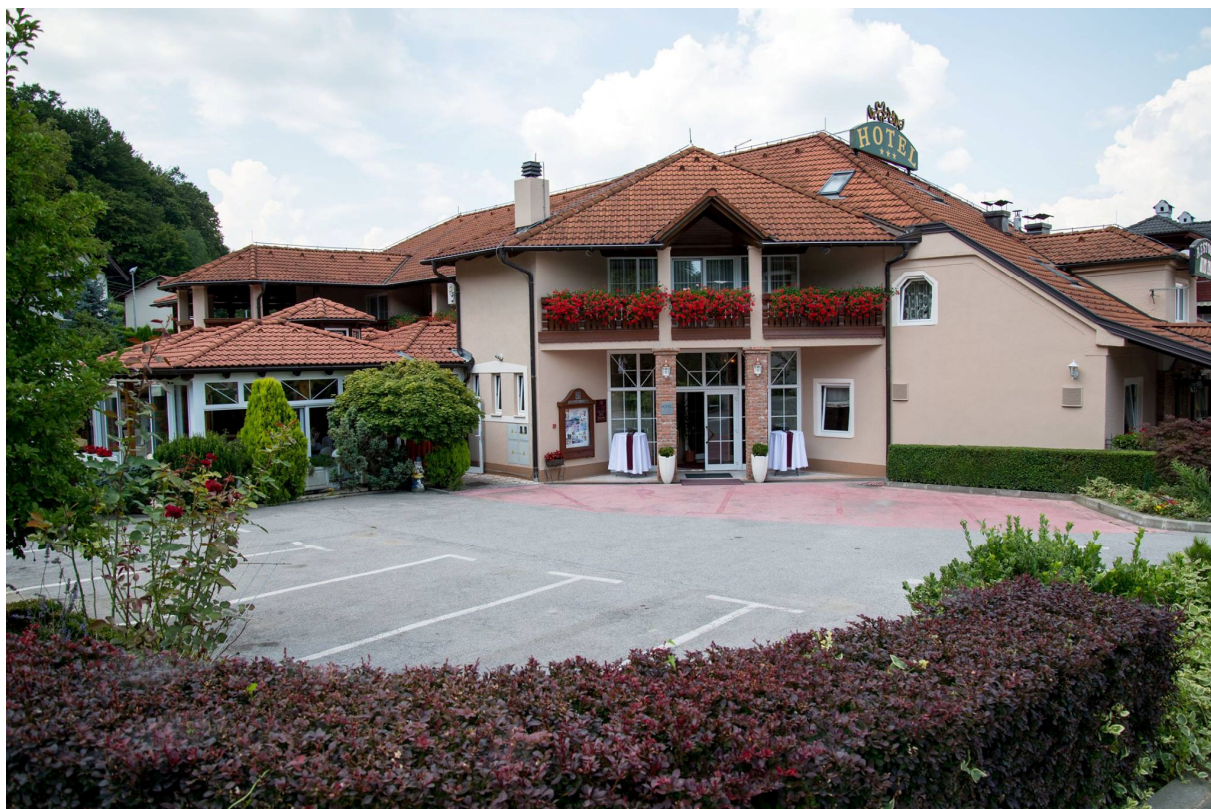
Hotel SE_MI (5 km from flyingsite) http://www.se-mi.hr/